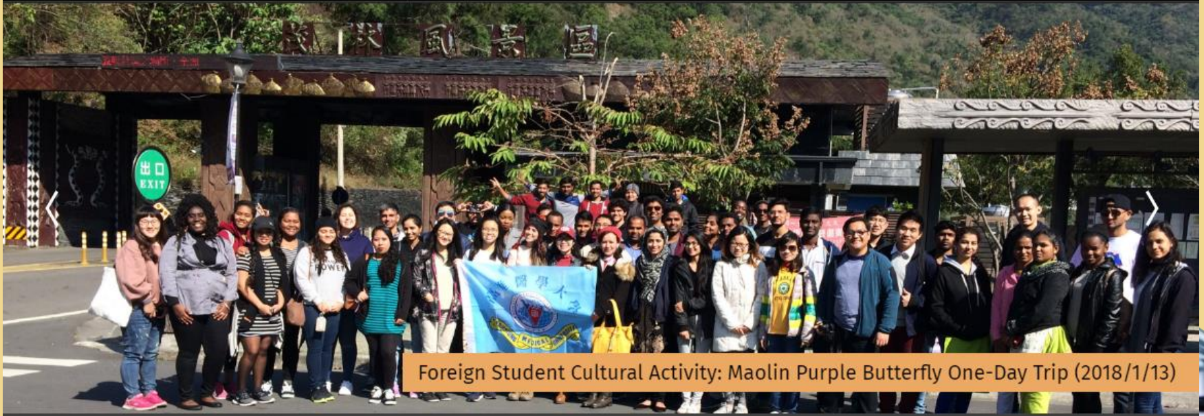
Foreign Student Cultural Activity: Maolin Purple Butterfly One-Day Trip (2018/1/13)

Home Kaohsiung Medical University SiteMap FAQ KMU Campus security line (Emergency only)